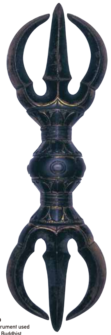
Sankosho Esoteric instrument used by monks in Buddhist ceremonies.